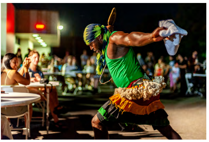
Beaverton Night Market (Note: photo taken pre-pandemic)

The Oregon Technology Business Center (OTBC) is a Beaverton-based incubator that helps entrepreneurs and startups build and grow companies. For the past seven years, the City of Beaverton and OTBC have teamed up to offer the Beaverton Startup Challenge that provides $25,000 a year in residence, onsite mentoring assistance, and support through investor meetings to each year's winners. In 2021, the Startup Challenge received 50 applications from for-profit, early-stage growth businesses with ambition and potential to succeed. From those, five winners were chosen, adding to the 30 previous startup winners whose CEOs include nine women, 11 people who identify as BIPOC, and two veterans who have gone