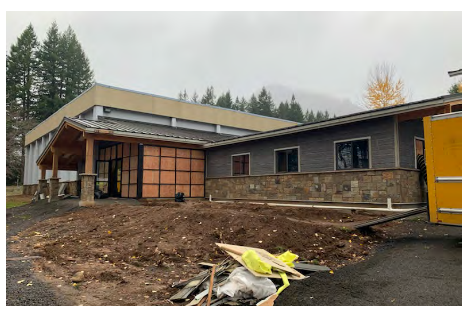
Detroit's new city hall and community center is currently under construction

The look of Detroit was forever changed on the nights of September 8 and 9, 2020. The Beachie Creek fire burned several buildings in Detroit on the night of September 8. The Lionshead fire hit the city the night of September 9 causing devastation to much of the rest of the city. Fire