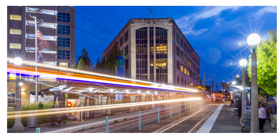
Beaverton City Hall

Beaverton is a friendly, active, and inclusive community, with a responsive government, where people value innovation and enjoy a high quality of life. Beaverton's Community Vision is one place where these ideals intersect. This citywide project includes extensive input from community members and provides a framework for helping to determine what kind of community we want for the future. The Visioning Advisory Committee—a volunteer group that leads community outreach efforts for the visioning process—is currently at work. When complete, their efforts