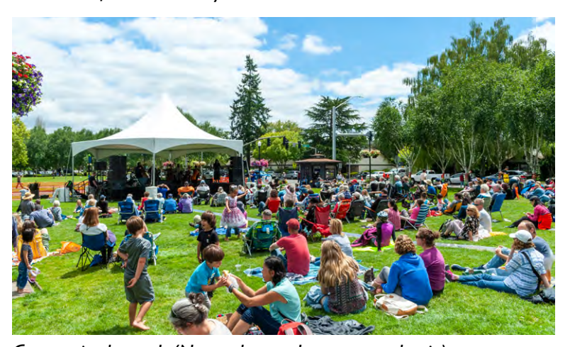
Concert in the park (Note: photo taken pre-pandemic)

A shining example was our partnership with Nike, Tualatin Valley Fire & Rescue, and the city's Community Emergency Response Team to host the first mass vaccination site in Washington County. This impressively efficient public-private partnership distributed nearly 50,000 life-saving doses of the COVID-19 vaccine. Additionally, the city supported dozens of vaccine clinics for the public, as well as multiple